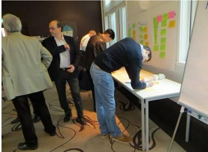
Workshop session on second day