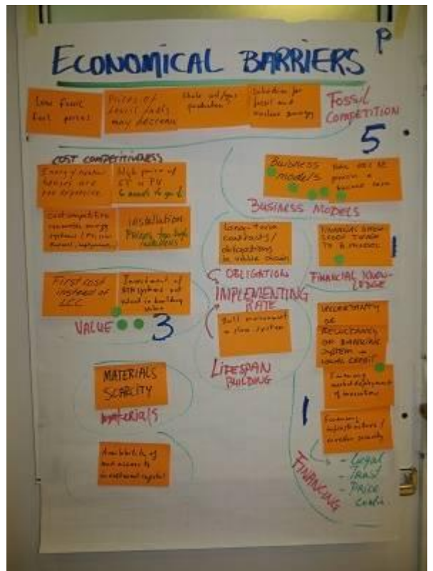
Result of first workshop