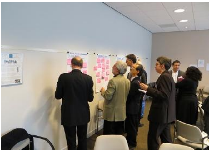
Workshop session on first day