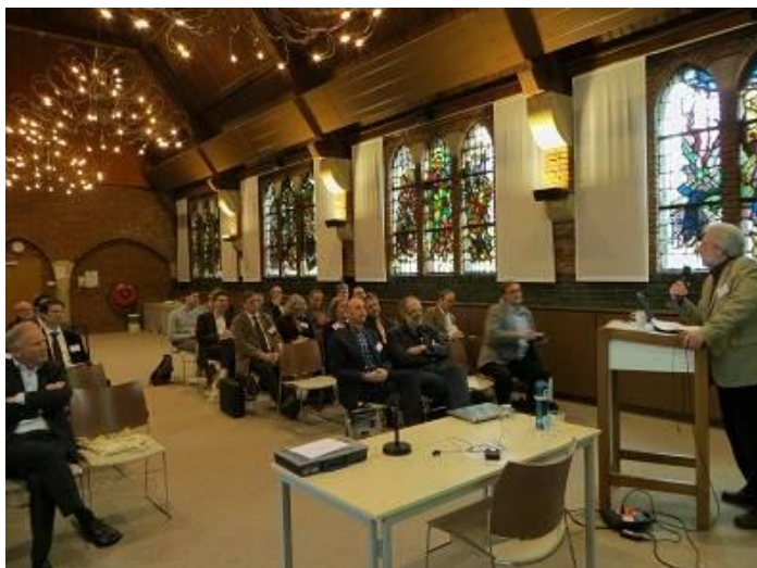
Presentation of workshop results