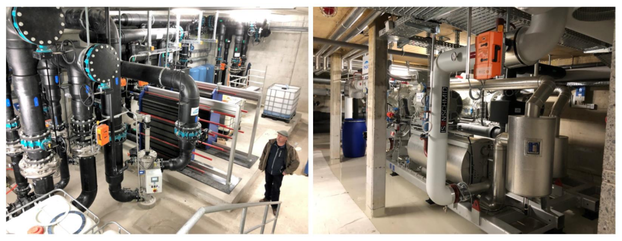
Figure 3. Left: 1 MW Heat pump; Right: Lake water pumping station. (Source: Corporation Weggis).

The lake water, cooled to around 2-4 °C, is returned to Lake Lucerne via a return pipe below the vegetation line at a depth of approx. 36 m.